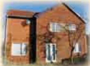
The new Ranskill headquarters