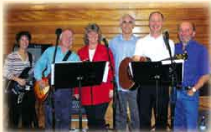
The BEC music group from Rugby enjoying a worship session at the Swanwick Conference Centre, where we have the new Derbyshire Suite reserved for 2006.

Ask us for details without obligation on 08000 92 78 92