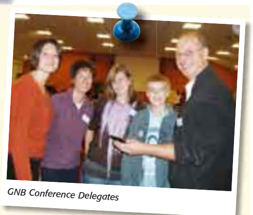
GNB Conference Delegates